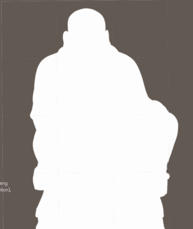
Stoneware figure of Budai Hesheng by Liu Zhen (according to inscription), China, 1486.

Enjoy a range of benefits as a Member and get the most out of the Museum and the collection.