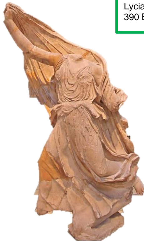
Nereid statue Lycia 390 BC

The Nereids symbolised everything that is beautiful and kind about the sea.