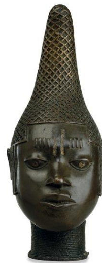
Commemorative head of a Queen mother Benin, Nigeria early 16 th century