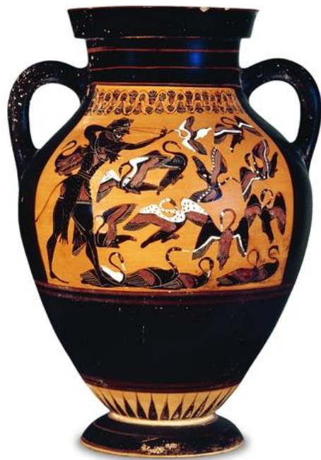
Black-figured amphora Herakles and the Stymphalian birds Athens, Greece around 540 BC