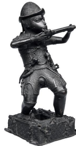
Brass figure of a Portuguese soldier holding a musket

The figure on the right shows a Portuguese soldier. He wears a typical 16 th century European costume, with steel helmet and sword, and he carries a flintlock gun. Guns were new to the people of West Africa when the Portuguese arrived. So Africans traded them from Europeans and learnt to make them for themselves, to help them in their wars against other peoples who still only had hand weapons or bows and arrows. Sometimes the king of Benin even employed Portuguese soldiers, like this man, to fight as mercenaries in his wars.