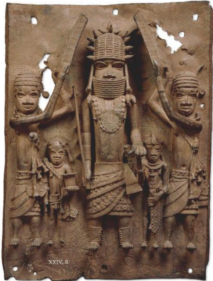
Brass plaque showing the Oba of Benin with attendants Benin, Nigeria 16th century AD