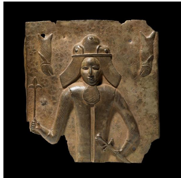
Brass plaque of a European

The plaques show how the people of Benin perceived the Portuguese traders and their soldiers, with their pointed noses, thin faces and beards and strange clothes. Their presence on the decorations of the king's palace shows how the Portuguese were regarded as symbols of the king's wealth and power, to which their trade contributed so much.