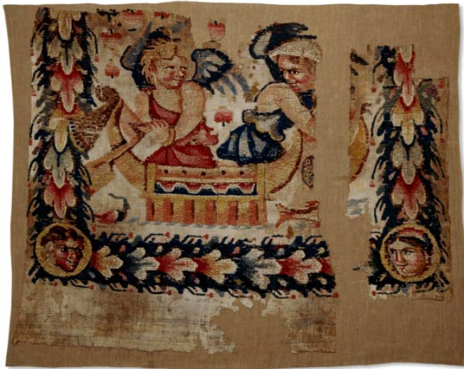
Textile with Eros figures in a boat from Akhmim, Egypt 4th century AD