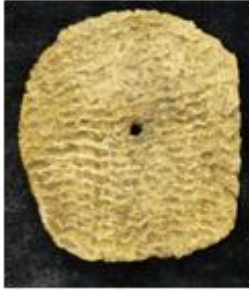
Plate with carved ornament, deep undulating lines, perforated in centre inv. 370/733