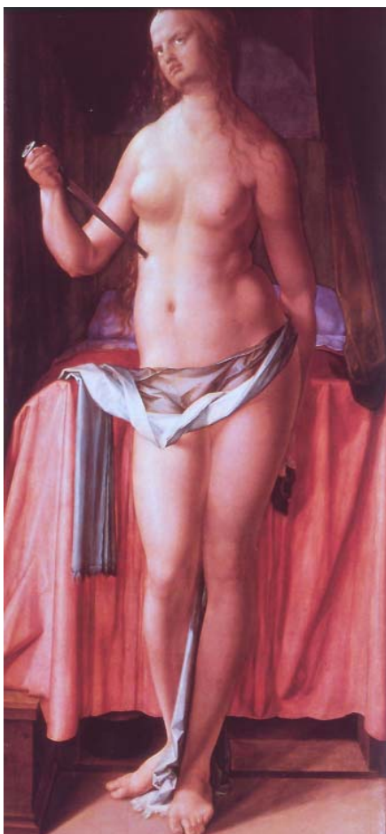
Plate 3 Albrecht Dürer, Death of Lucretia , 1518. Panel painting. Munich, Alte Pinakothek.