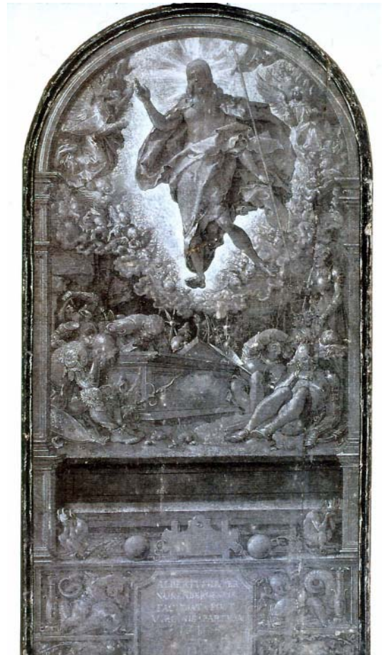
Plate 11 Albrecht Dürer, The Resurrection of Christ , design for the epitaph of Ulrich Fugger, c. 1506–10. Brush and grey wash heightened with white on grey prepared paper. Vienna, Albertina.