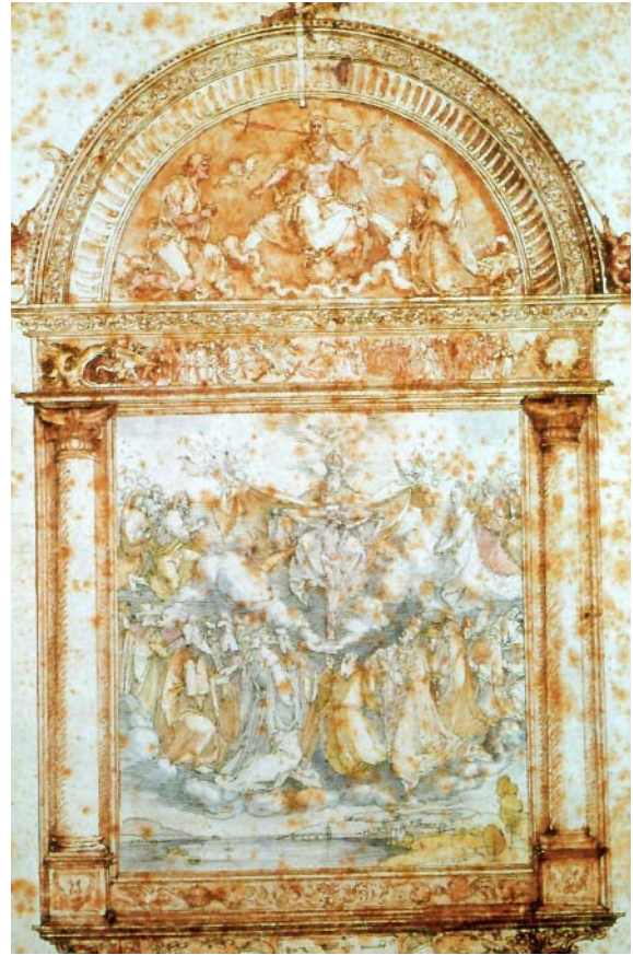
Plate 6 Albrecht Dürer, Study for the Landauer Altarpiece, 1508. Pen and brown ink with watercolour. Chantilly, Musée Condé.