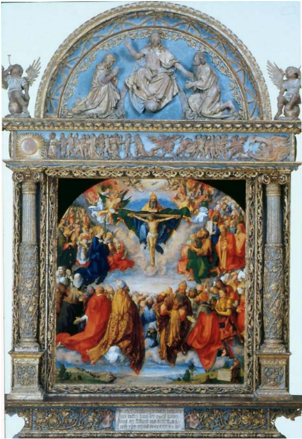
Plate 5 Albrecht Dürer, The Landauer Altarpiece , 1511. Nuremberg, Germanisches Nationalmuseum (frame) and Vienna, Kunsthistorisches Museum (painting).