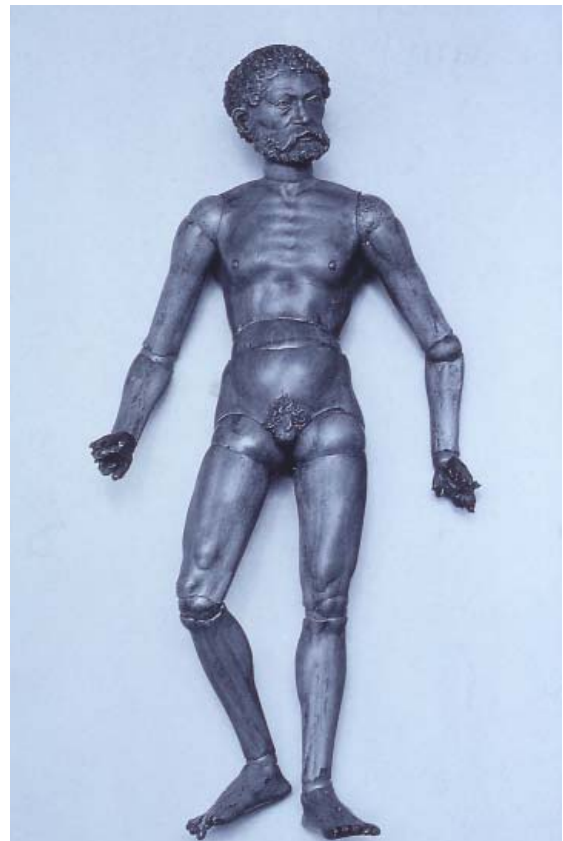
Plate 18 Master IP, Male maquette figure, c. 1520–30. Fruit wood. Hamburg, Museum für Kunst und Gewerbe.