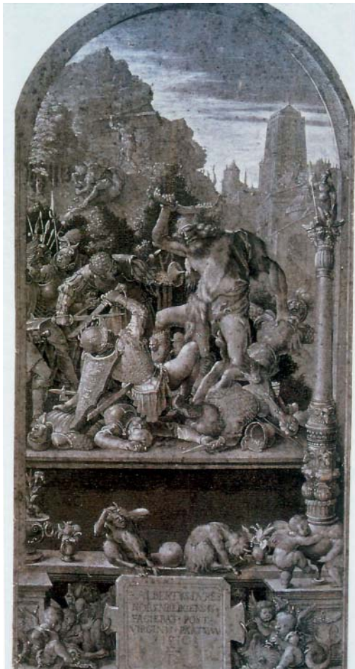
Plate 10 Albrecht Dürer, Samson slaying the Philistines , design for the epitaph of Georg Fugger, c. 1506–10. Brush and grey wash heightened with white on grey prepared paper. Berlin, Staatliche Museen Preussischer Kulturbesitz Kupferstichkabinett.