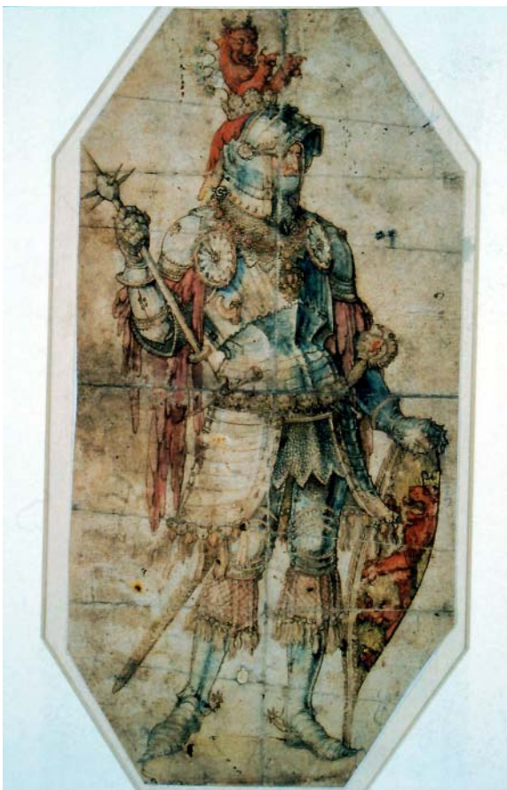
Plate 14 Albrecht Dürer, Design for the bronze figure of Albrecht IV of Austria , c. 1512. Pen and black ink with watercolour. Berlin, Staatliche Museen Preussischer Kulturbesitz, Koperstichkabinett.