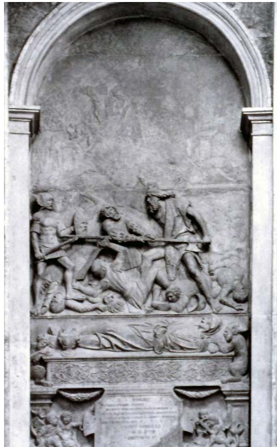
Plate 13 Workshop of Adolf Daucher, marble epitaph for Georg Fugger, c. 1515. Augsburg, Fugger chapel.