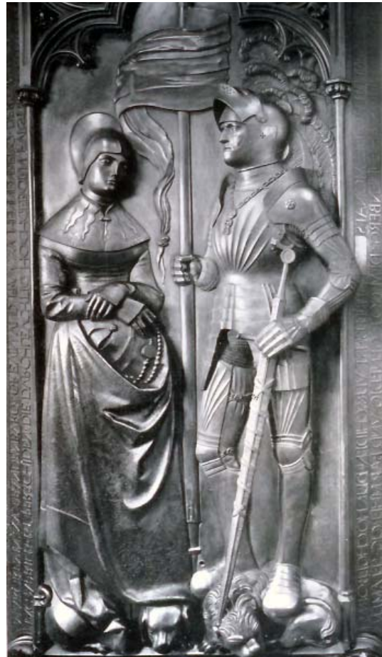
Plate 8 Hermann Vischer the Younger, Tomb for Countess Elisabeth of Brandenburg and Count Hermann of Henneberg, c. 1510–12. Bronze. Römhild (Thuringia)