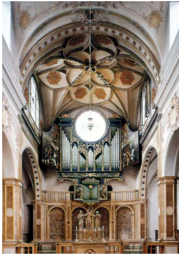
Plate 9 View of the Fugger chapel, completed in 1518, in the church of St Anna, Augsburg.