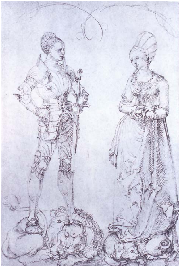
Plate 7 Albrecht Dürer, Study for a tomb , c. 1510. Black ink. Oxford, Christ Church.