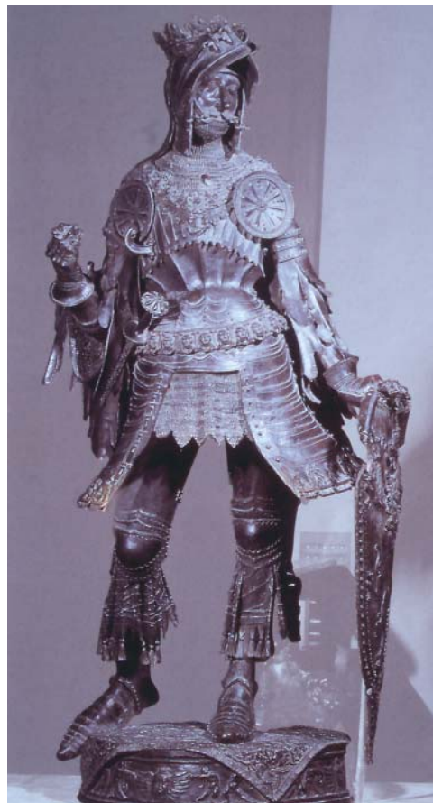
Plate 15 Stephan Godl, Albrecht IV of Austria, c. 1517/18. Bronze. Innsbruck, Hofkirche.