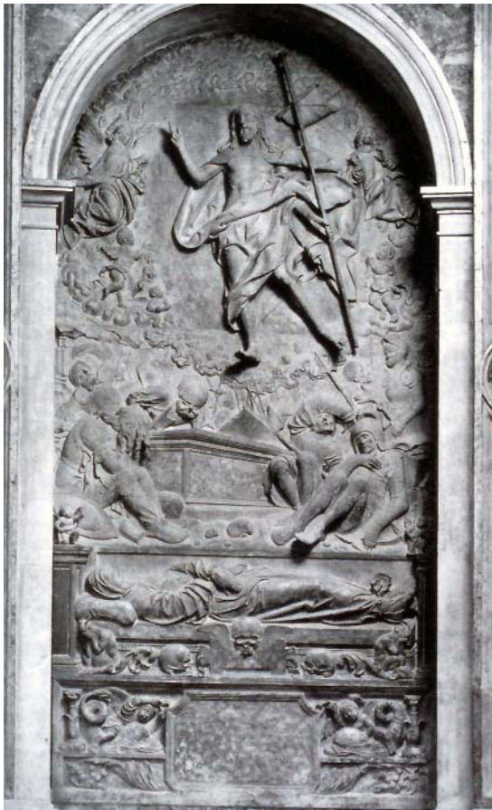
Plate 12 Workshop of Adolf Daucher, marble epitaph for Ulrich Fugger, c. 1515. Augsburg, Fugger chapel.