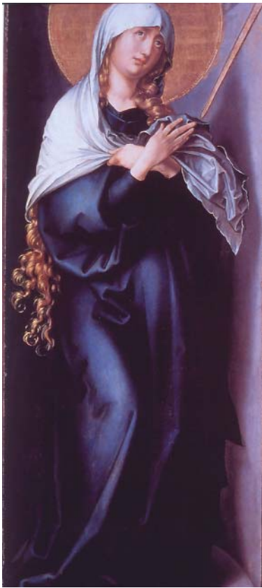
Plate 1 Albrecht Dürer, Virgin of Sorrows , c. 1495–98. Panel painting. Munich, Alte Pinakothek.