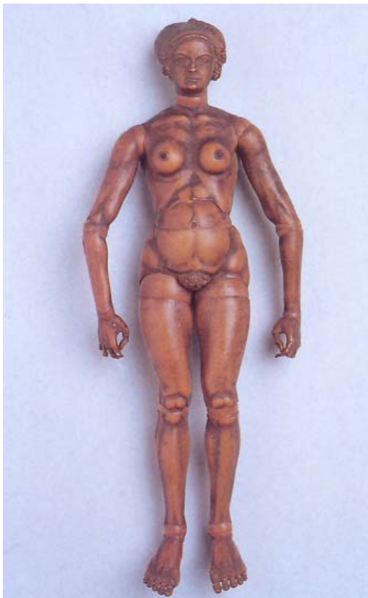
Plate 17 Master IP, Female maquette figure, c. 1520–30. Wood. Leipzig, Museum für Kunsthandwerk.