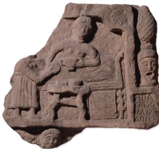
Kirkby Thore Tombstone From Kirkby Thore, Cumbria AD100-400