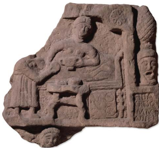
Kirkby Thore Tombstone From Kirkby Thore, Cumbria AD100-400