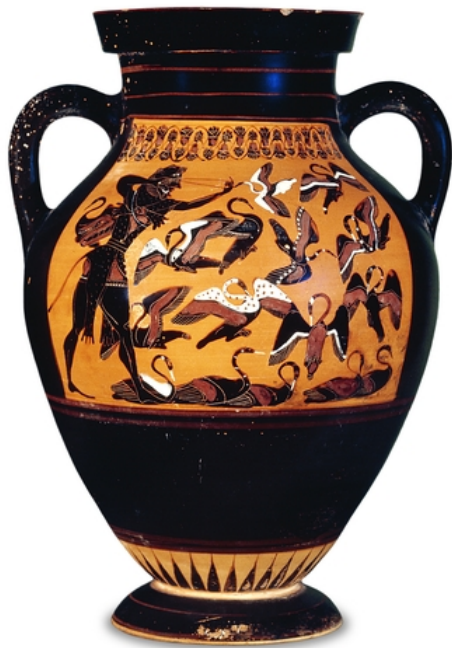
Black-figured amphora Herakles and the Stymphalian birds Athens, Greece around 540 BC