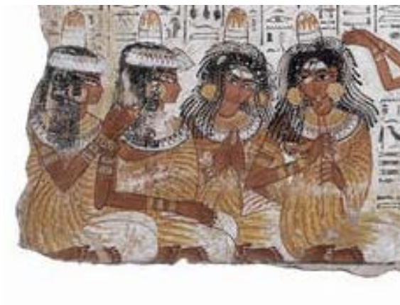
Painting from the Tomb of Nebamun Thebes, Egypt 1370 BC