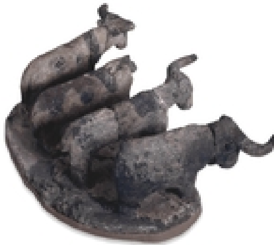
Painted pottery group of cattle. From el-Amra, Egypt. 3500 BC