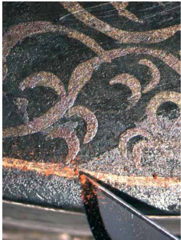
FIGURE 11. Detail of the lid from lime box 2005,0115.13, showing the removal of a corrosion layer on the surface of the silver alloy decoration: image size: 6 × 4.5 mm

The surface cleaning of the other boxes was carried out with white spirits on cotton wool swabs. Some corrosion on the silver-braze inlays was removed mechanically with a scalpel (Figure 11), and with Silvo® in white spirits on cotton wool swabs while working under a stereomicroscope at ×20 magnification. On some black surfaces it was found that the sheen was slightly altered. This was thought to result