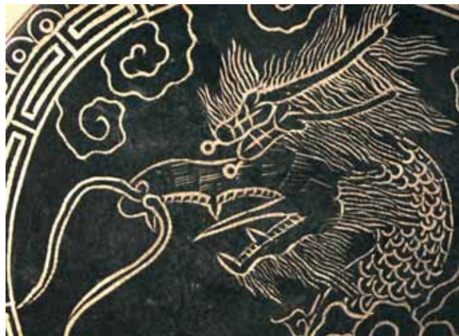
FIGURE 7. Detail of a lid of wu tong ink box 1992,1109.4 before treatment: image size: 30 × 22 mm