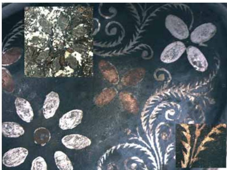
FIGURE 5. Detail of the lid of lime box 2005,0115.12 after treatment. The inset to the upper left shows a detail of the inside where the shape of the chased decoration and remnants of lime can be seen. The inset to the bottom right shows a detail of the triangular shape of the engraved lines filled with silver braze: main image size 12 × 9 mm

is very similar to the use of silver strips on wu tong boxes. The decorative channels on two boxes in the collection were engraved (Figure 5) or chased (Figure 6) and inlaid with molten silver brazing alloy, again similar to wu tong boxes, Figure 7; note the sharp points typical of engraved lines in Figures 5 and 7. Additionally, on one box sheets of silver and copper were brazed into recesses made by chasing, Figure 5. The colour difference between both the copper and silver sheets and the silver braze surrounding them is noticeable. Other boxes were built up from outer sheets of cupro-nickel or copper and flat lids with complex annular polychrome decorative schemes have been built up linearly, Figure 8. On these lids there is no underlying metal base plate into which the elements were set – the components were simply brazed to each other. The chevron patterns were made by twisting