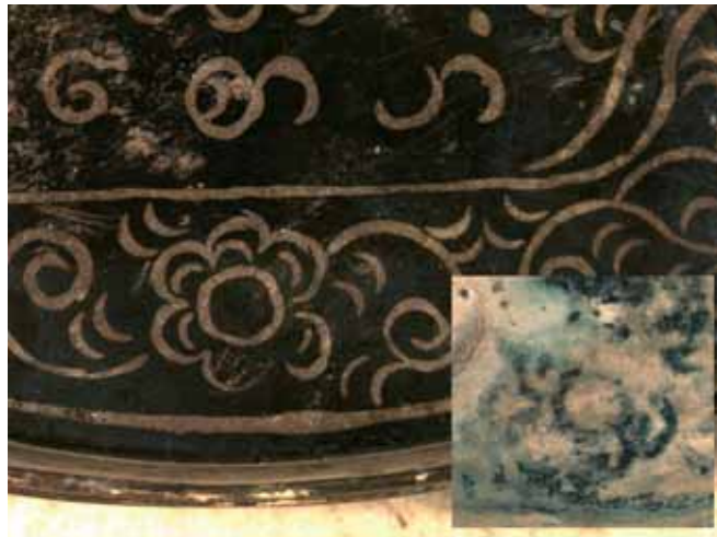
FIGURE 6. Detail of the lid of lime box 2005,0115.13, made of black alloy, silver braze alloy inlay and silver strips, after treatment. The inset is a detail of the inside where the shape of the chased decoration and remnants of lime can be seen: main image size: 30 × 22 mm