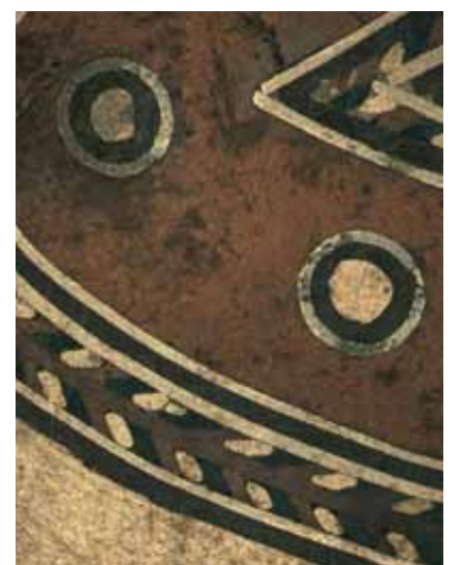
FIGURE 9. Detail of the lid shown in Figure 8. The chevrons comprise mylar (black), copper (red) and cupro-nickel alloy (white). The parallel bands of copper-arsenic alloy and cupro-nickel alloy are brown-black and white in colour respectively: image size: 15 × 11 mm