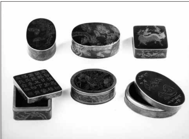
FIGURE 3. Selection of ink boxes formerly in the Collier collection, made of wu tong with silver braze alloy inlays, dating to the nineteenth or early twentieth century: 1992,1109.1–6