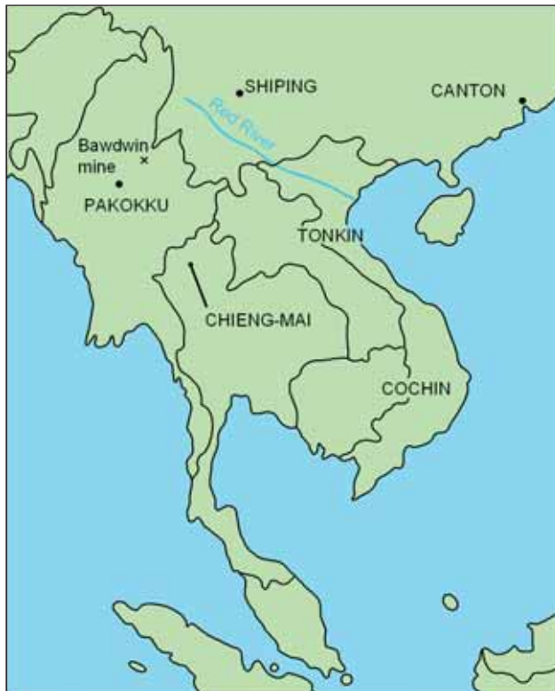
FIGURE 1. Map showing some of the locations where the black-patinated alloys have been produced in south east Asia

Japanese irogane metals have been appreciated for over a century in the west, but more recent work has shown that similar patinated alloys were being made in many centres in east and south east Asia, Figure 1 [7, 8], and that some, notably the sawasa wares, seem to have been made in the seventeenth and eighteenth centuries especially for sale to the west [9]. The number of regional varieties and centres of