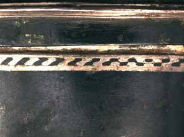
FIGURE 10. Detail of the chevron pattern on lime box 2005,0115.14; untreated. The left shows the outer surface of the twisted wire, at the right the wires were filed down to the middle causing a change in the pattern to rectangles: image size 30 × 22 mm

together combinations of wires of different metals, such as silver, copper, black-patinated alloy or a copper-arsenic alloy (Figure 9), to make a cable with a helical seam. In one instance it is clear that the inlaid twisted wire was filed down to the centre of the twisted wires revealing changes in pattern, Figure 10. The use of the different alloys – copper, cupro-nickel, mylar and copper-arsenic alloy – in and next to the chevron patterns creates an attractive colour scheme and the minor differences in alloy composition are clearly intentional.