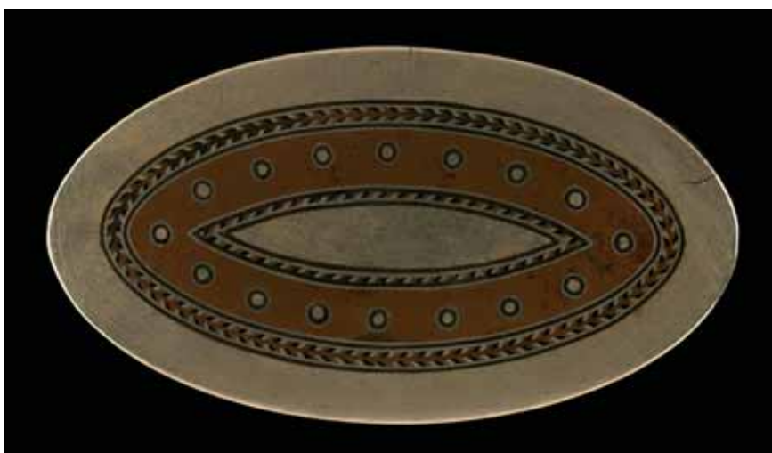
FIGURE 8. Lid of lime box 2005,0115.16, decorated with concentric bands of red and white, chevrons of red, white and black, brown-red and white bands and 16 circles of white and brown-red; untreated