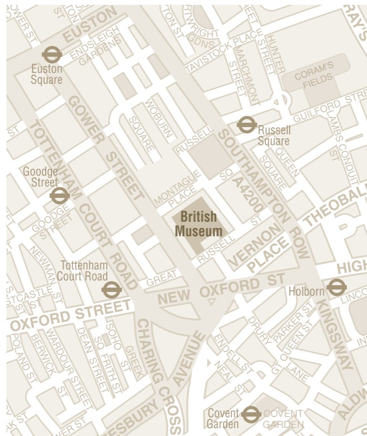
Produced by Global Mapping © PC Graphics