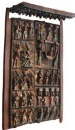
Carved doors and lintel. Yoruba people, Nigeria. Early 20th century.