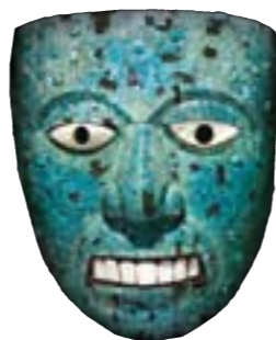
Turquoise mask Aztec/Mixtec, 15th–16th century AD.