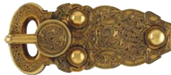
Gold belt buckle from the Sutton Hoo ship-burial. Anglo-Saxon, early 7th century.