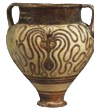
Pictorial Style bowl (krater) depicting an octopus. From Ialysos (modern Triánda), Rhodes. Mycenaean Greek, about 1400–1300 BC.