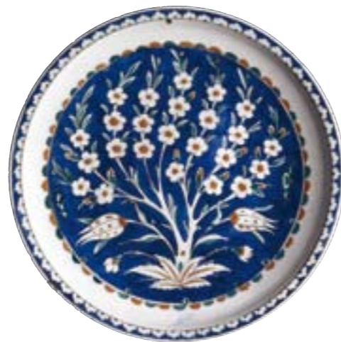
Iznik dish. From Turkey, AD 1570–1600.

£60, includes refreshments, but not lunch