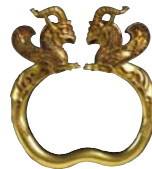
Gold griffin-headed armlet from the Oxus Treasure. From the region of Takht-i Kuwad, Tajikistan. Achaemenid Persian, 5th–4th century BC.