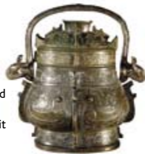
'You' bronze ritual wine vessel. China, Western Zhou dynasty, 10th century BC.

WebQuests are a new range of enquiry-based activities which use the online collections of nine national museums. To find out more, visit http://nmolp.britishmuseum.org/webquests