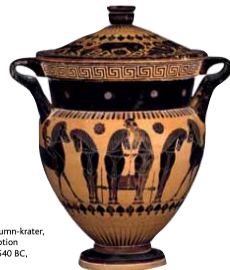
Right: Black-figured column-krater, attributed to the Inscription Painter. Greek, around 540 BC, possibly made in Italy.

Explore highlight objects from the Classical world including statues, painted pottery and the world-famous Parthenon frieze.