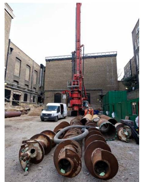
Piling rig in the project site, May 2011