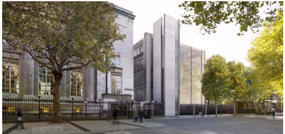
Rendered view of new Centre on Montague Place