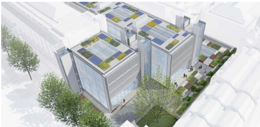
Architectural impression of special exhibitions gallery