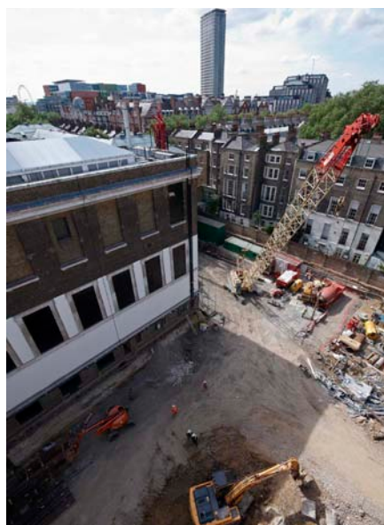
Site activity, May 2011