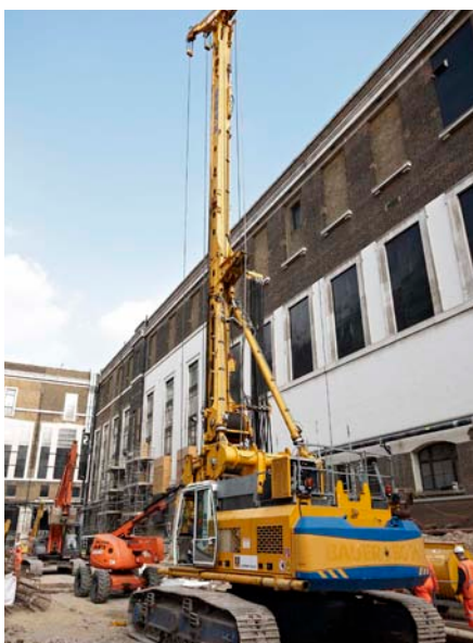
Piling rig in the project site, May 2011

which, along with the secant wall, will provide foundations for the building. The next major stage of work is the bulk excavation to form the deep basement which commences in July. A reinforced concrete wall, or capping beam, will be installed to join the tops of all the secant piles together. When the capping beam is complete in a particular area, temporary props will be attached to it. The props keep the secant wall in position during the bulk excavation. As the basement goes deeper additional props will be installed.