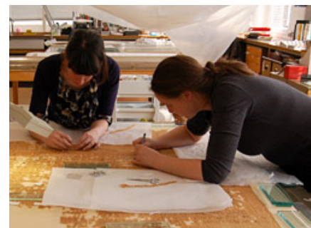
Conserving an ancient Egyptian shroud

The procurement of future works packages is a major activity for the project team. Appointments have recently been made for both vehicle and passenger lifts with current tender activity including the structural steel frame, the building envelope and the mechanical and electrical services packages.