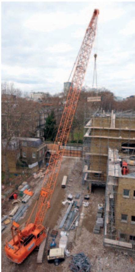
Demolition in the project site, February 2011.