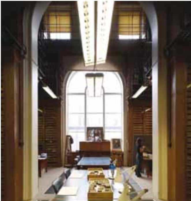
Current Arched Room view obscured by a Portakabin