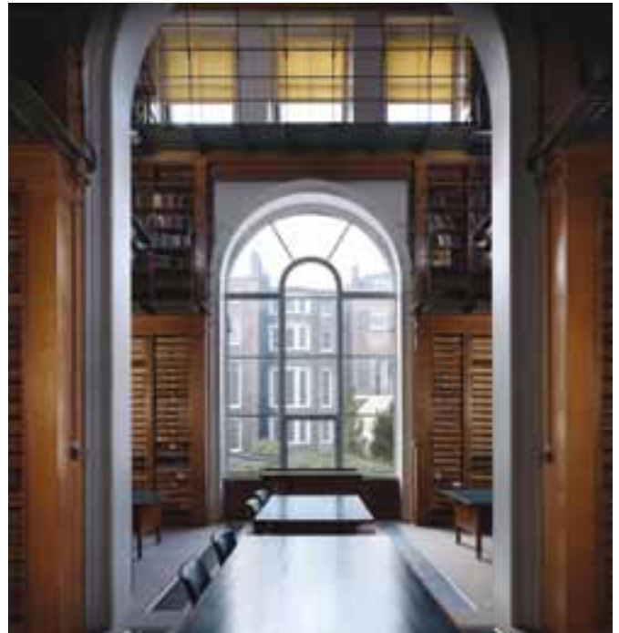
Proposed Arched Room with unobscured view

order to modify the conditions. The Museum proposes to replace the existing blind with one which has increased translucence; this will help maintain the view of the Bedford Square properties at the same time as reducing the detrimental effects of direct sunlight into the room.