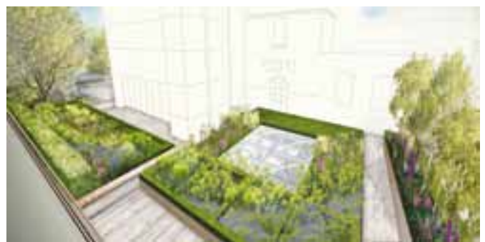
Proposed landscaping outside the Arched Room window

The proposed World Conservation and Exhibitions Centre, with its new landscaped western perimeter and the substantial removal of Pavilion 5, will maintain adequate daylight to the rear of the properties in Bedford Square, and will improve the current view from their rear rooms. In particular, the environment of Bedford Square will be significantly enhanced by the removal of the ad hoc arrangement of temporary and low quality service buildings which currently clutter the site, and their replacement with the new Centre and a belt of landscaping on the boundary.