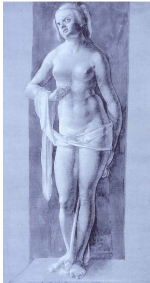
Plate 4 Albrecht Dürer, Study for the Death of Lucretia , 1508. Brush and grey wash heightened with white on green prepared paper. Vienna, Albertina.