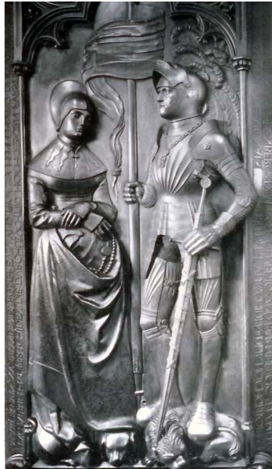
Plate 8 Hermann Vischer the Younger, Tomb for Countess Elisabeth of Brandenburg and Count Hermann of Henneberg, c. 1510–12. Bronze. Römhild (Thuringia)