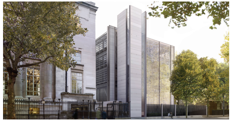
Rendered view of Montague Place elevation

A party wall surveyor has been appointed to liaise with all neighbours who have a party wall interface with the project. The party wall surveyor appointed by the British Museum is Anstey Horne. It is their role to ensure the physical property of the third party buildings adjacent to the site are not compromised by the construction work and to agree any protocols that need to be followed.