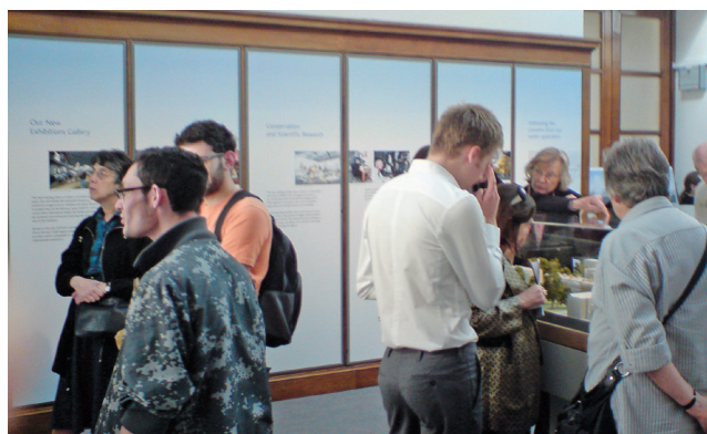
Visitors to the public exhibition, September 2009

Protection of the public is considered from many aspects. This includes vehicle and pedestrian segregation, and lifting strategies so lifting of materials over exposed public walkways does not occur and that protection decks are installed where this is required.