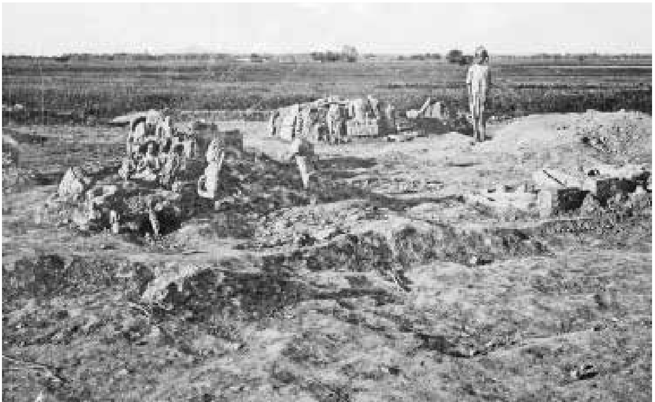
Figure 2 Stupa bases at Mound D, Sahri-Bahlol, with re-used sculptures in situ (From M.A. Stein, 'Excavations at Sahri-Bahlol', Archaeological Survey of India Frontier Circle 1911-12 , Peshawar, 1912, part 2, section 5; also M.A. Stein, 'Excavations at Sahri Bahlol', Archaeological Survey of India 1911-12 , Calcutta, 1915, A. No. 371, S. No. 1199)