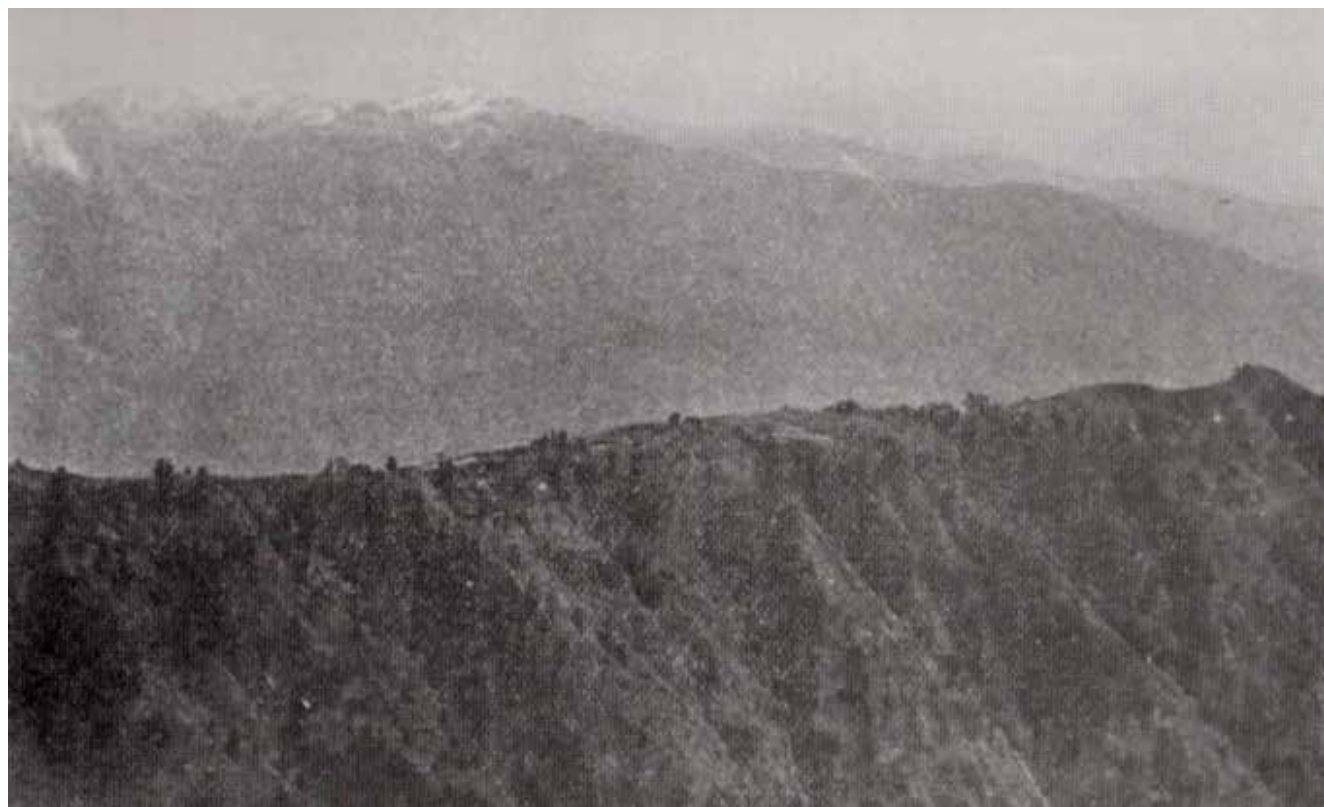
Figure 4 Pir-Sar ridge (From M.A. Stein, 'An archaeological tour in Upper Swat and adjacent hill tracts', Memoirs of the Archaeological Survey of India 42, Calcutta, 1930, fig. 38)

Stein's expedition in Udyana ended with his ascent of Mount Ilam, or Ilam-Sar. Situated to the south east of Birkot, this mountain has the reputation of being a sacred place for both Hindus and Buddhists ( Fig. 5 ). For this reason, it had