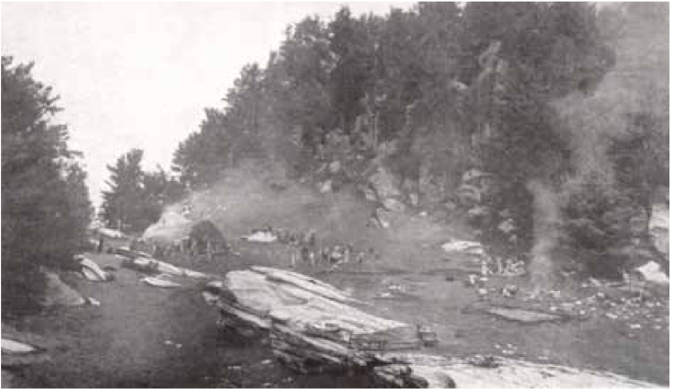
Figure 5 Ilam-Sar with sacred pool and Xuan Zang's 'stone couches' (From M.A. Stein, 'An archaeological tour in Upper Swat and adjacent hill tracts' 1930, fig. 66)

long been of interest to Stein, and he was determined to reach its summit. Less than two weeks after his ascent of Pir-sar, Stein reached the summit of Mount Ilam. He saw what he expected to see: the oblong stone heap believed by Hindus to be the seat of Rama and the couch-like rocks recorded by Xuan Zang as the place where the Buddha in his former life renounced the world. 55 While surveying Pir-Sar, Stein had noted that the distance from Birkot (the town from where people fled to Aornos) to Ilam was closer than the distance from Birkot to Pir-Sar. Therefore, he suggested, in terms of distance, it would be more logical for the people of Birkot to flee to Ilam. 56 However, because Stein believed that Massaga, the first town seized by Alexander, was situated to the south of Birkot, he thought it would not make sense to flee southwards (where Ilam was) as this would not offer safe refuge, given that the area was occupied by the Macedonians. For this reason, when Stein visited Ilam, he did not make the link with Alexander, and thus occupied himself with the sacred sites of Hindus and Buddhists instead.