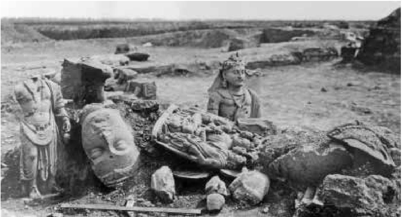
Figure 3 Detail of a stupa base at Mound D, Sahri-Bahlol, with re-used sculptures in situ

coins all of the 'Later Kushans' (i.e. Kanishka II to Kipunada, c. mid 3rd–4th century AD) and their successors (i.e. Kidarites, 4th–5th century AD) from mound F. 40