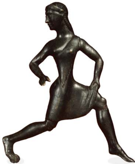
Bronze figure of a running girl Found at Prizren, Serbia Greek, 520-500 BC