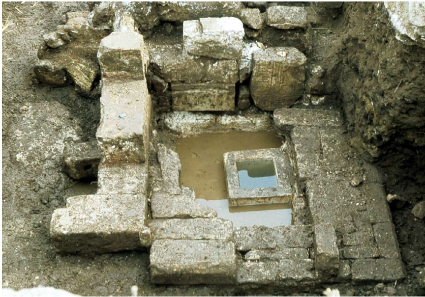
Fig. 1: The architectural remains as found at el-Ashmunein. The floor with the Canopic box is on the right of the wall with the door-jamb, belonging to an adjoining structure.